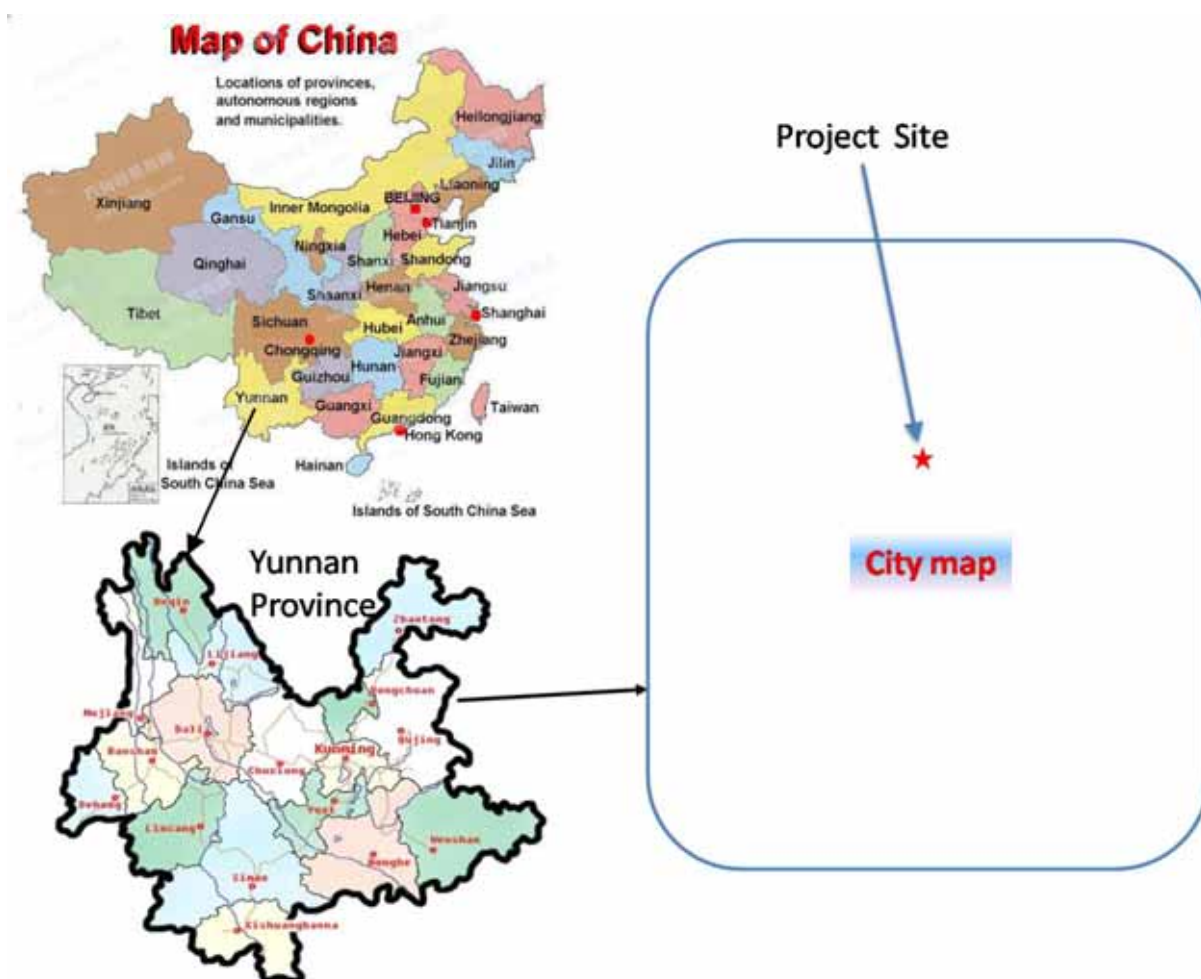
Fig. A.1 Geographical location of the proposed CPA in Yunnan province, China.

( ) is located in ( ), and Yunnan province (Fig. A.1). The GPS of the proposed project site are Lat. ( ) N, Lon. ( ) E.