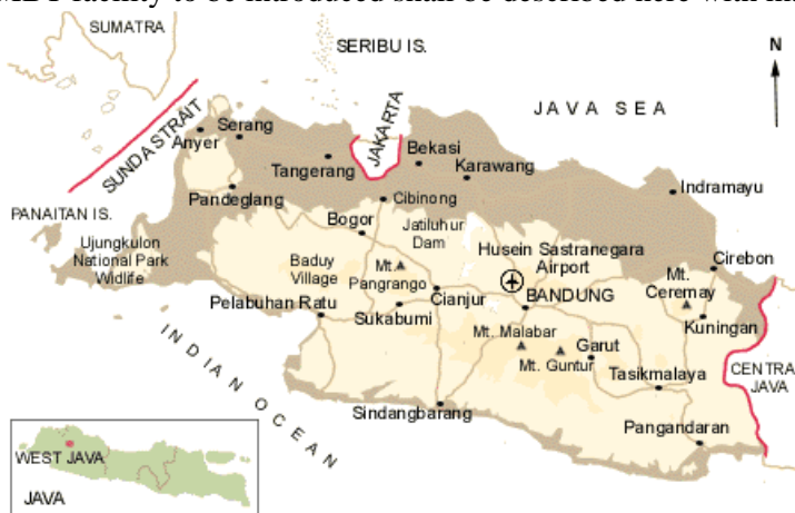
Figure 1: Map of West Java Province

* The location of the MBT facility to be introduced shall be described here with map.