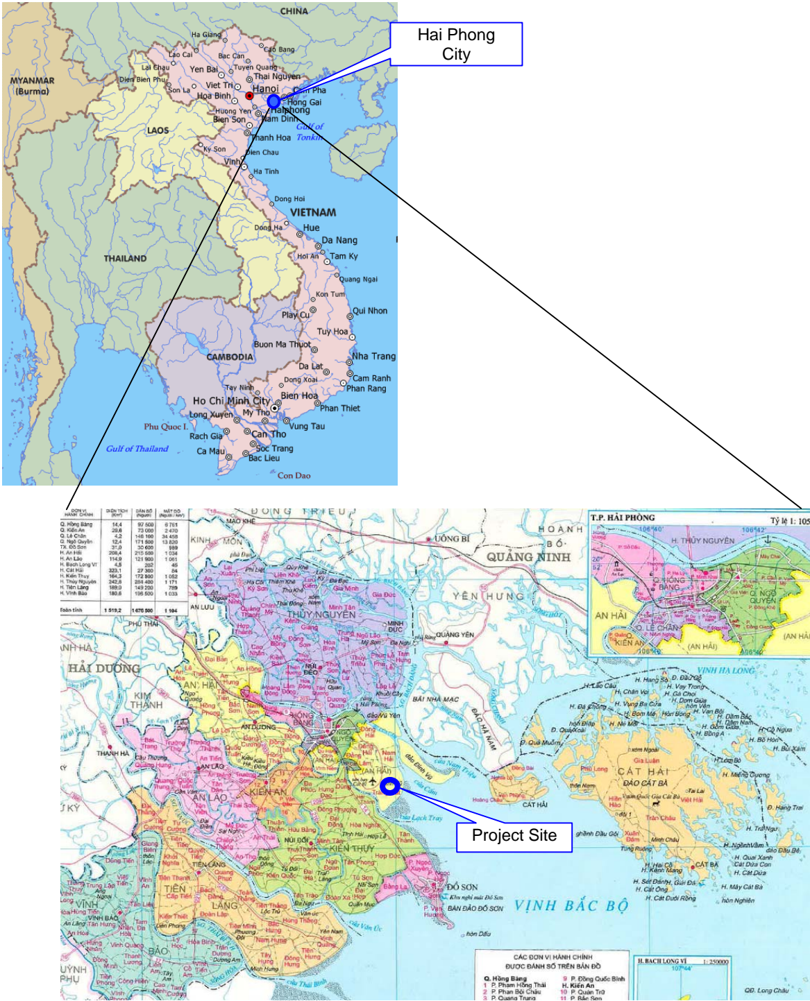
Figure 1: Map of Viet Nam and location of project site in Hai Phong City