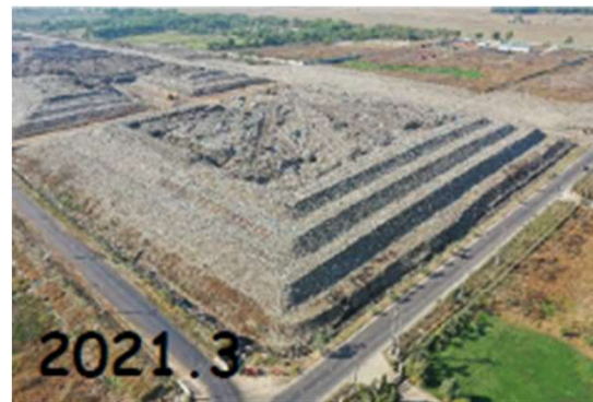
Fukuoka method lot case in Yangon