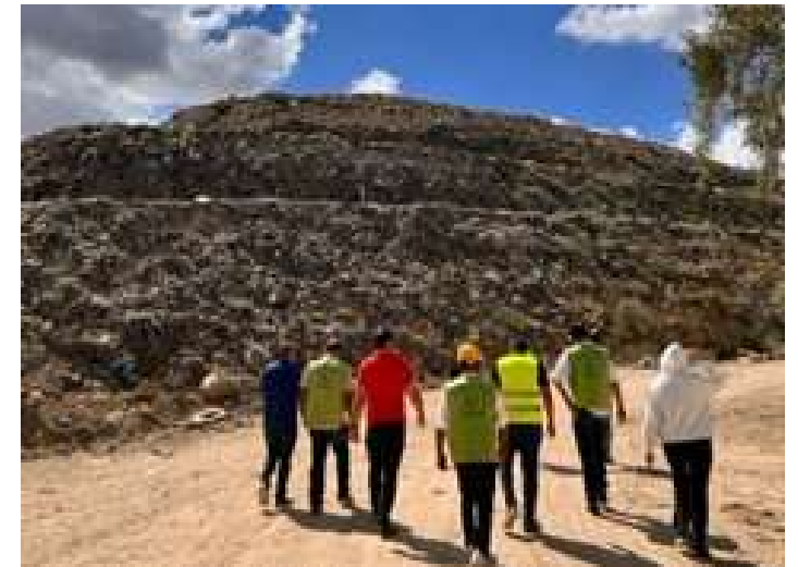
In Tunisia, Sep. 2023