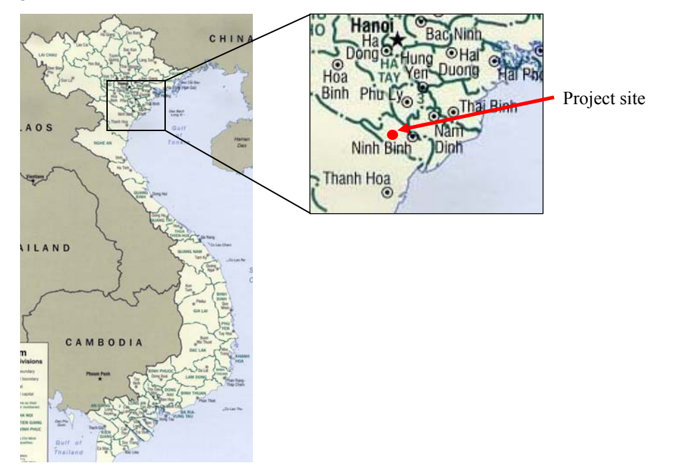
Figure 1: Location of the Project activity

The physical location of the project activity site is shown in Figure 1. The project will be hosted by the ELMACO Tapioca Starch Co., Ltd. in Ninh Binh Province, Viet Nam located at latitude 20° 33' N and longitude 105° 75' E.